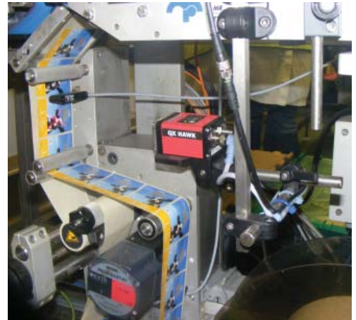
A barcode system can be used to validate labels prior to final packaging.

Many food packaging facilities currently rely on paperwork checks and human intervention to detect inaccurate product labels. Labels are attached to paperwork and manually signed off. Often errors can be missed, especially if label designs are similar, and this can result in costly food mislabels. This also applies to “spliced” reels in which multiple reels of labels are attached together. Packaging suppliers can easily splice the wrong labels together, resulting in an operator placing the correct label reel on a food packaging assembly machine, but inadvertently switching to an incorrect label design midway through the process. Operators packing the product may not notice the change due to high line speeds.